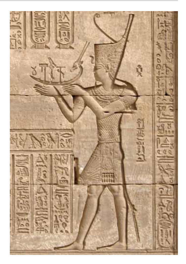
The Emperor Trajan depicted in the Egyptian style making offerings to the Egyptian gods. Dendera Temple complex, Egypt.

We still live in the empire of this world. It may have changed its shape, but it has not changed its nature.