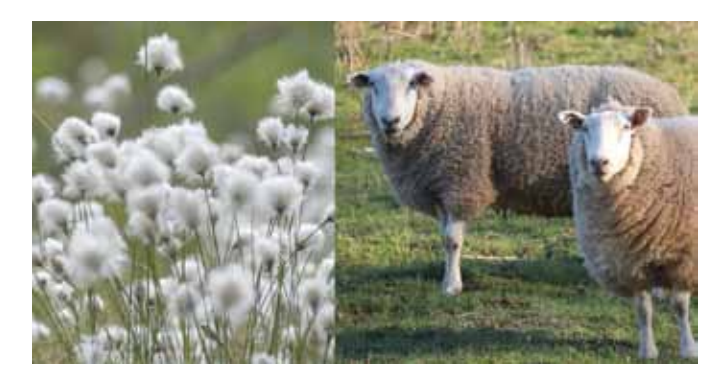
Cotton (left) and sheep's wool (right), two of the most common sources of natural fibres.

Organically grown cotton generally uses much less water, and no harmful pesticides or fertilisers. Additionally, organic certification by the GOTS also