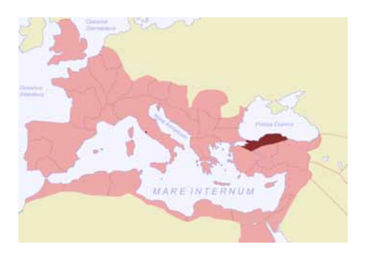
The Roman world under Trajan; Pliny's province of Bithynia and Pontus is highlighted (dark).

In this context, Christians were atheists. They refused to sacrifice to or even acknowledge other gods, and they would not pay religious honours to the emperor. Such actions set them against the gods and the established order: against the gods, a-theists. What's more, in the minds of many, this non-conformity threatened the pax deorum : the peace maintained with the gods by means of proper worship. Thus when plague struck or war raged these disasters were often seen as the direct result of divine displeasure brought about by people like the Christians for their stubborn refusal to participate fully in the system. This non-participation also undermined Roman efforts at social control and constituted a potential political threat, as Christian fellowship assemblies