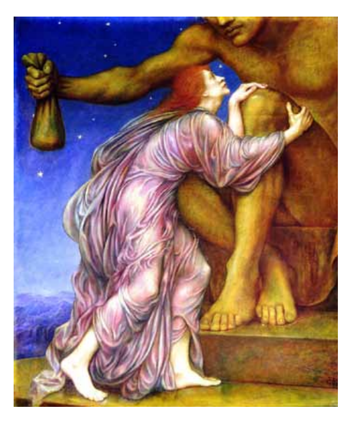
The Worship of Mammon by Evelyn De Morgan, 1909.

The cheapest shirt, isn't necessarily the one that reflects the best decision: where was it made, by whom, and with what fibre (see p. 13)? Every purchase you make rewards someone: creates revenue for them that means they will be around tomorrow. As you walk up and down the aisles, or fill your cart on the website, you are helping create the